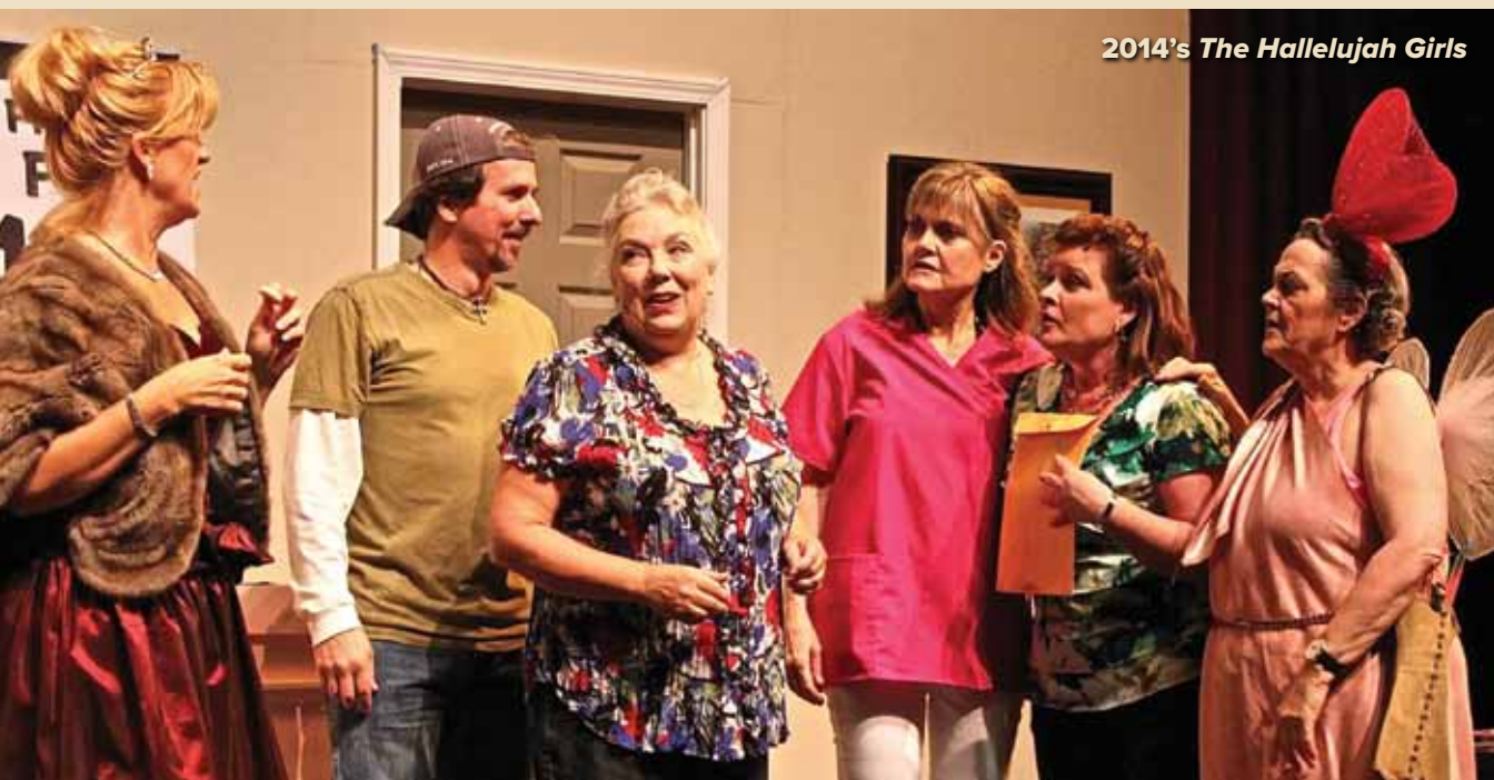
2014's The Hallelujah Girls