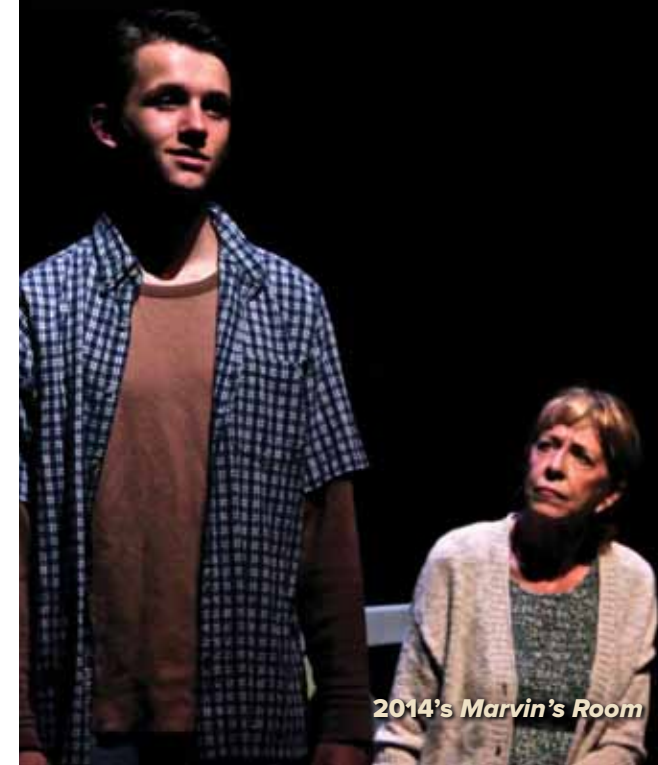
2014's Marvin's Room