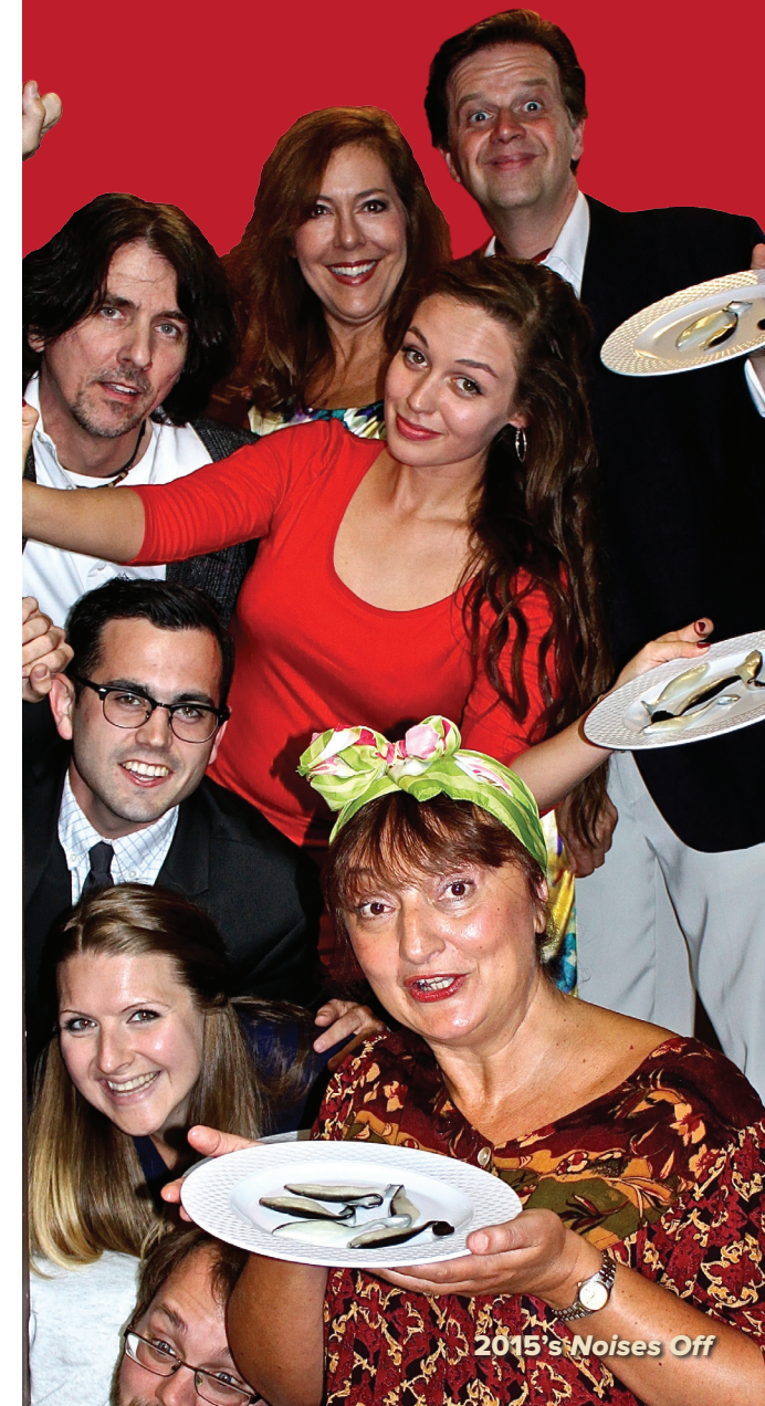
2015's Noises Off