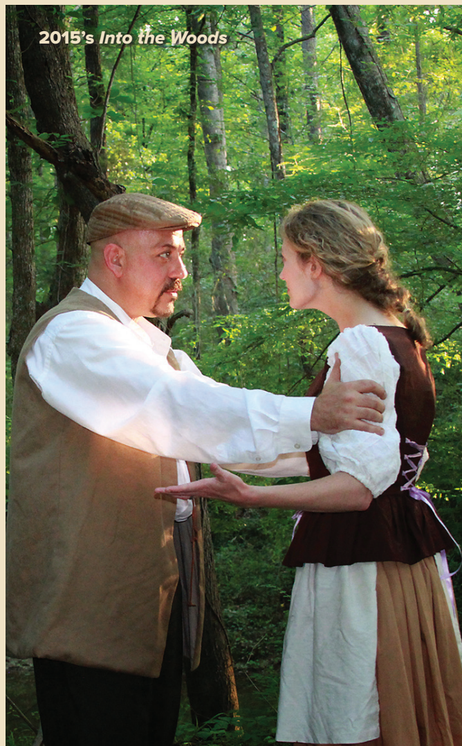
2015's Into the Woods

From I-26 take Exit 102A to Lake Murray Blvd. Turn left at the 2nd traffic light by CVS Pharmacy onto College Street.