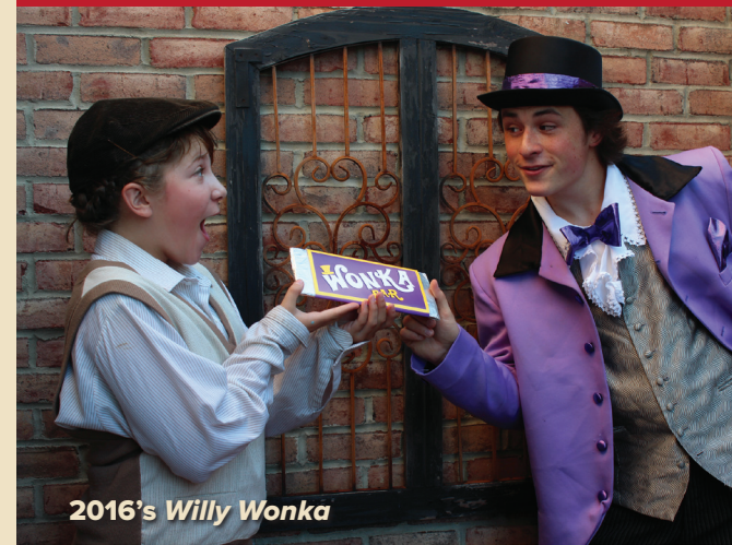
2016's Willy Wonka