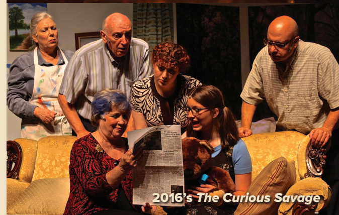
2016's The Curious Savage

Please use Amazon or Amazon Prime by signing on with smile.amazon.com and choose Chapin Community Theatre as your charity. It's no cost to you and we get a percentage of your expenditures from Amazon — how cool is that!