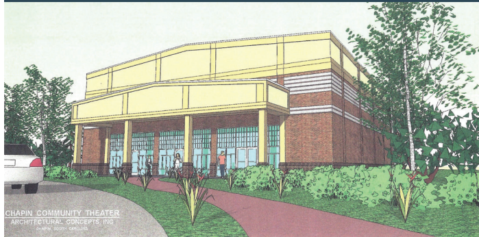
CHAPIN COMMUNITY THEATRE ARCHITECTURAL CONCEPTS 1/18 © 2018 JIMMY GARDNER

Help us reach our Stage 1 building fund goal of $750,000. This will allow us to complete the basic building.